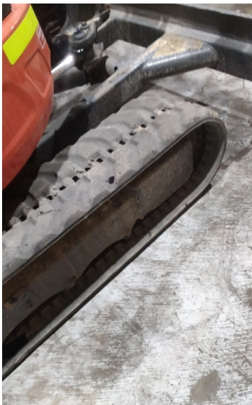
Tyre Condition 4