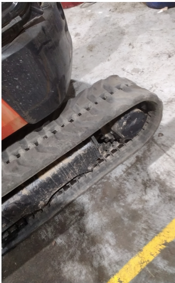
Tyre Condition 4