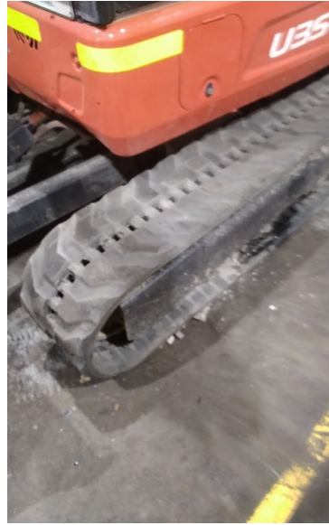
Tyre Condition 1